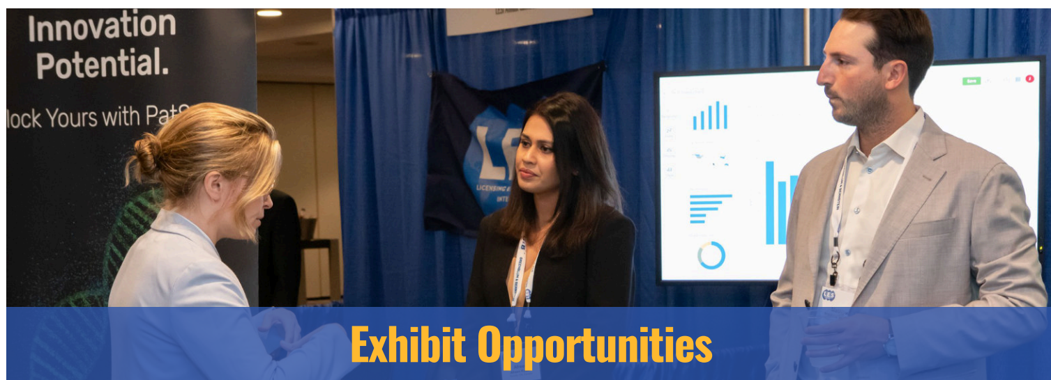
EXHIBIT SPACE PACKAGE